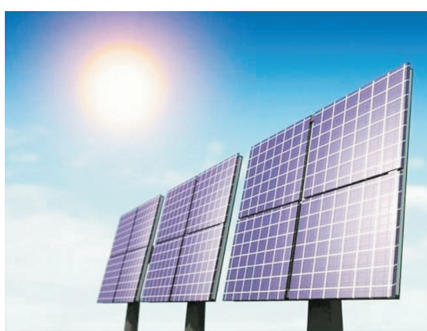
(Light Solar Pannel)