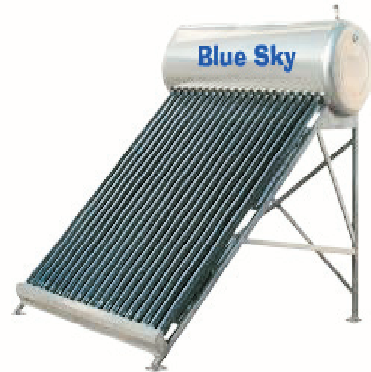
(SS Solar Water Heater)