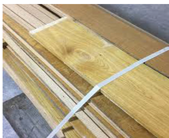
(Laminated Flooring Parketingl)